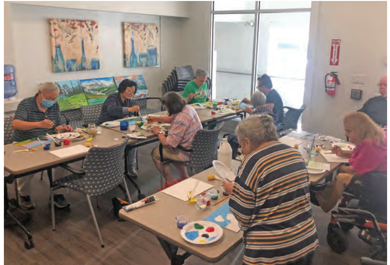
Above right: Casselman House residents enjoy a popular monthly canvas painting class in June.